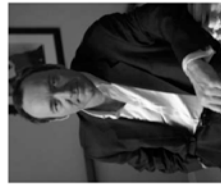
Kevin Spacey RICHARD, DUKE OF GLOUCESTER