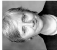
Gemma Jones (UK) QUEEN MARGARET