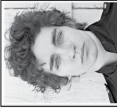
Robert Sheehan CHRISTOPHER MAHON